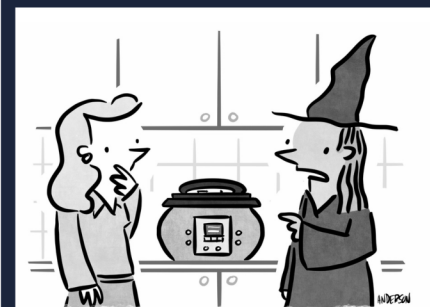
"It's one of those new Instant Cauldrons. You put a kid in here with some eye of newt and an hour later it's the best thing you've ever eaten."

Get your FREE "Cyber Security Tip of the Week" at: www.PcPlusNetworks.com/cyber-security-tip-of-the-week